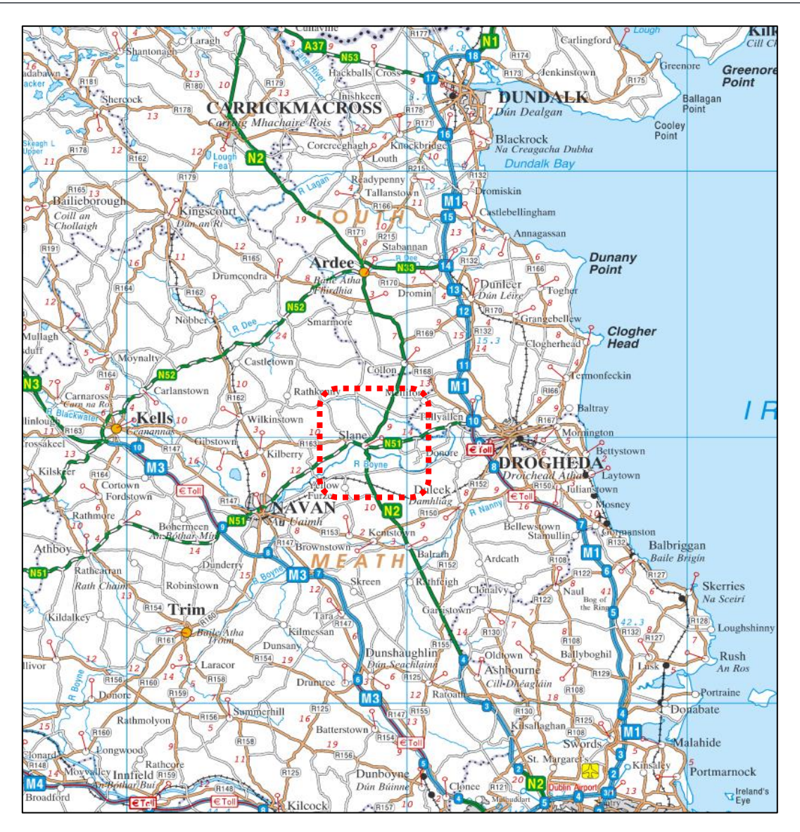
Figure 1.1: Scheme Location in a Regional Context